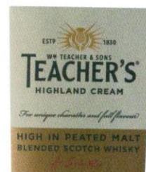
Kumar Labels: Playing with the process