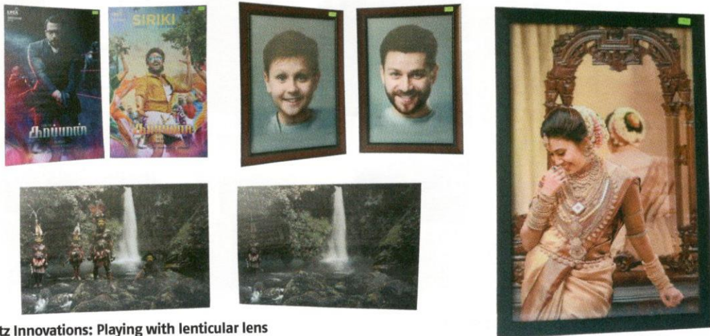
Antz Innovations: Playing with lenticular lens

PrintWeek Digital Printer of the Year 2019: Antz Innovations