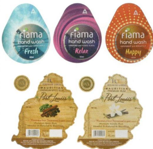
Any Graphics: Making labels tactile

Joint Winners – Label Printer of the Year (Self-adhesive) 2019: Any Graphics | Kumar Labels